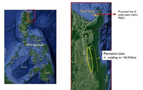
Figure 13: Location of sites relative to Port Irene